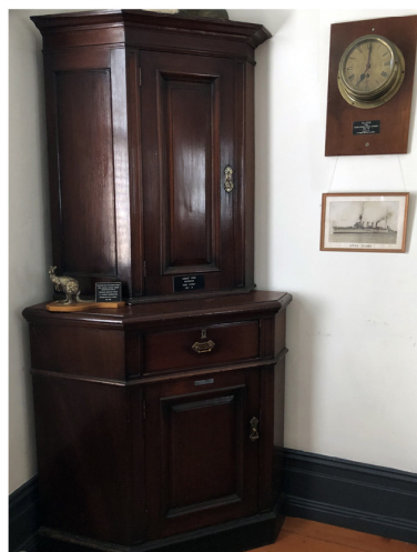
Left: WW1 artefacts in the lounge. From 'HMAS Sydney': * Wardroom Furniture; * Wardroom Clock; * Photo of the ship. From the German Cruiser 'Emden': * Kangaroo figurine cast from brass taken from the ship.

Under Bill's guidance, all flags have been laundered (thanks Sue) and signed out preparatory to having them frozen for two weeks at Newcastle Museum. Two of the flags are very fragile and will need careful treatment and storage when they are returned.