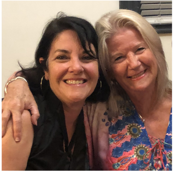
Above: NCYC Cruising Fleet buddies.